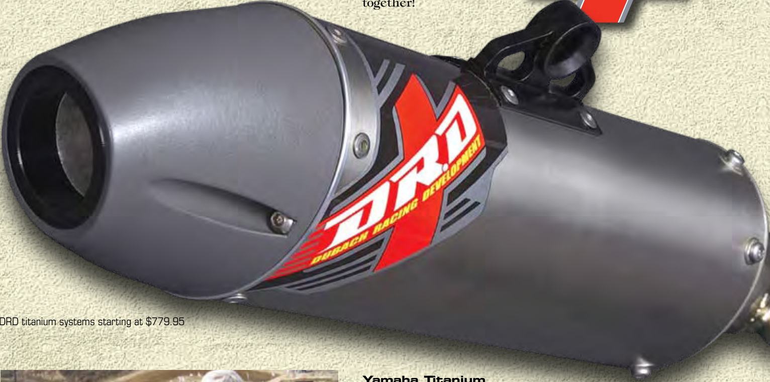
DRD titanium systems starting at $779.95